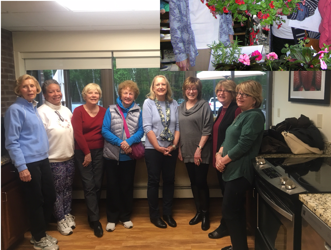
Naubuc Green Crew