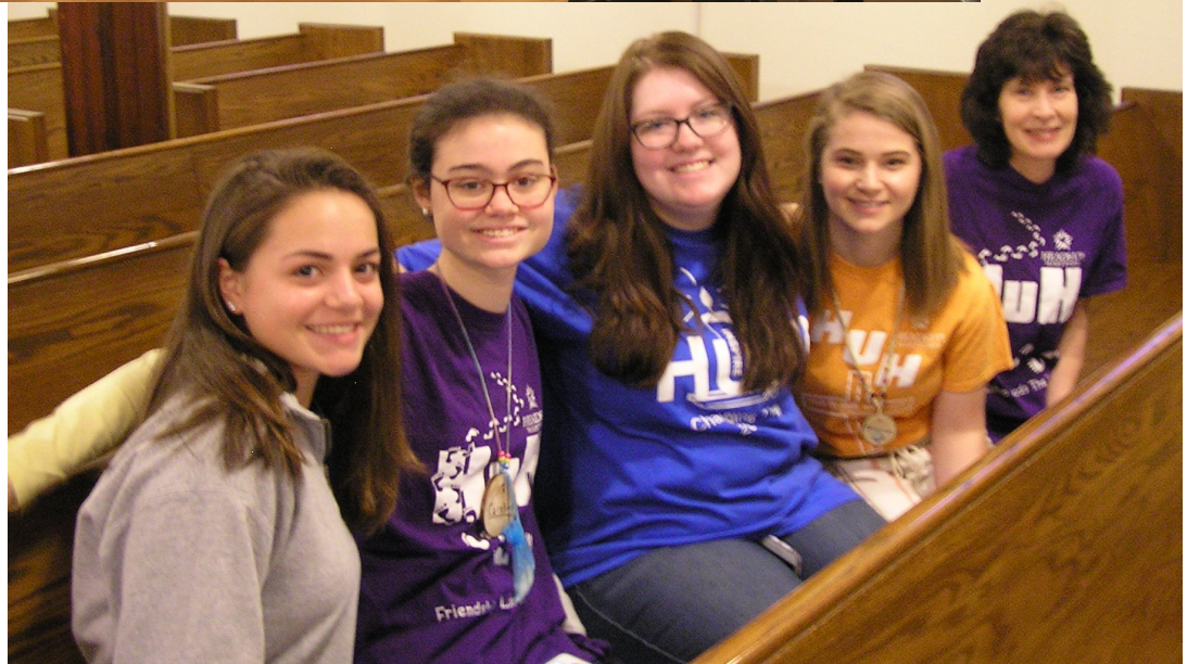
Heads Up! Hartford Team