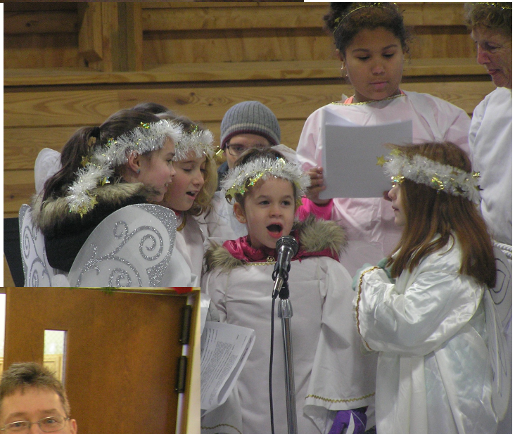
Christmas Pageant with St. Luke's