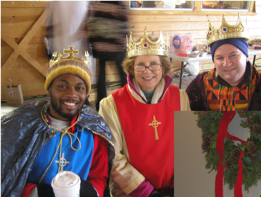
3 Kings at the Pageant