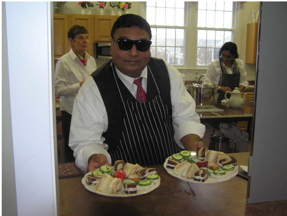
type serving his creations at the Christmas High Tea