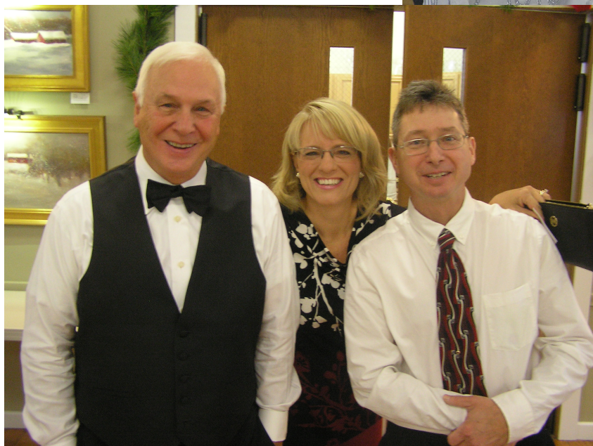
Dapper Servers at the Tea