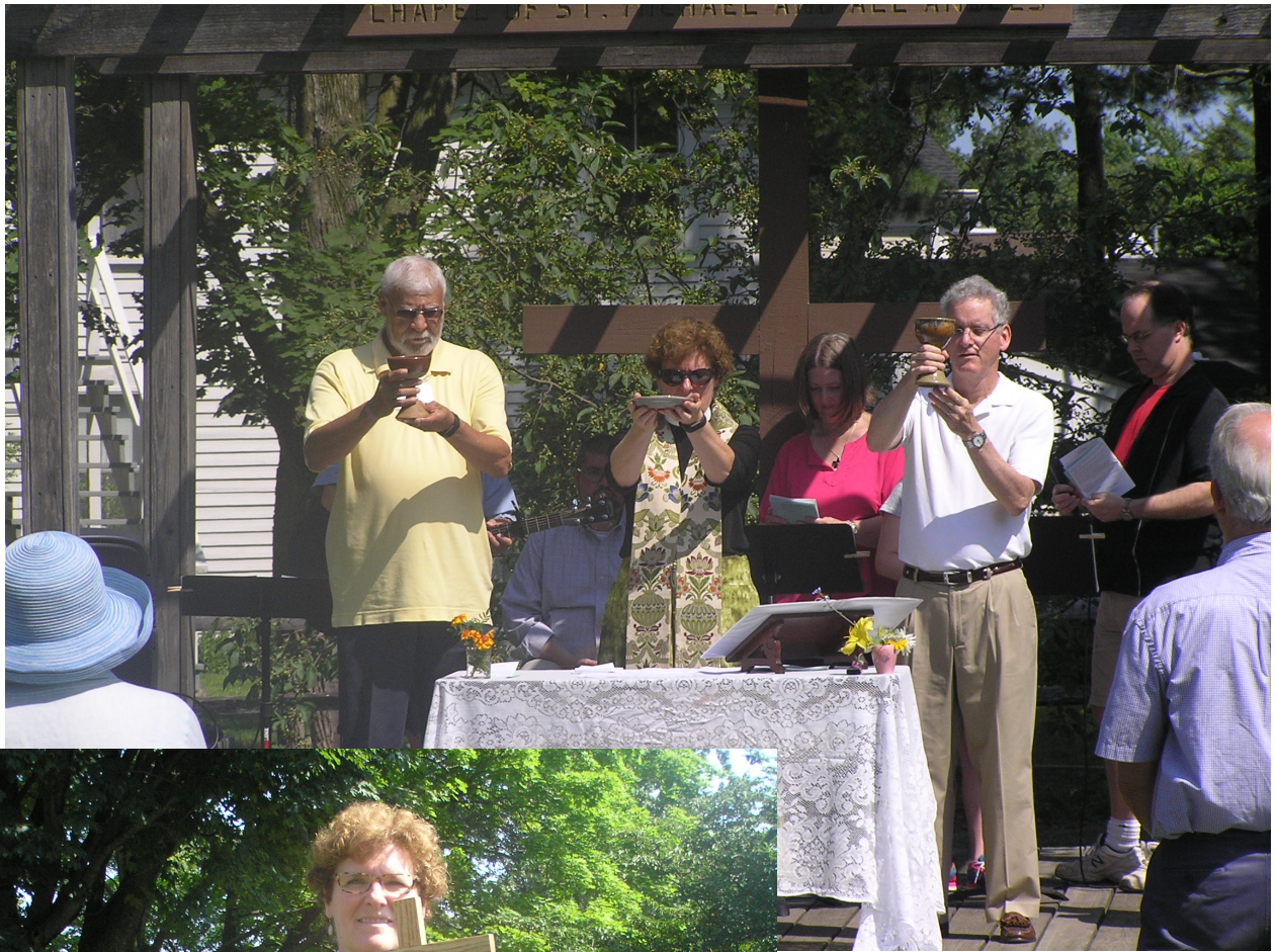
Summer @ St. James'