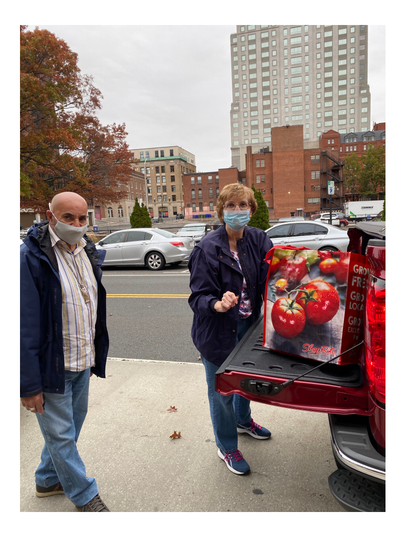
Lunch in the Park, Hartford