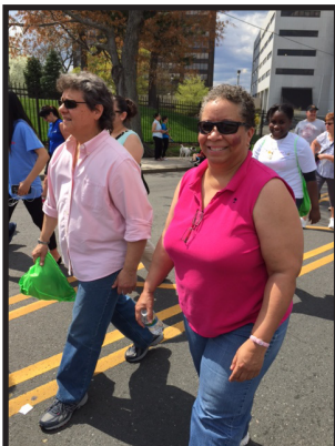
It was a cookie walk.