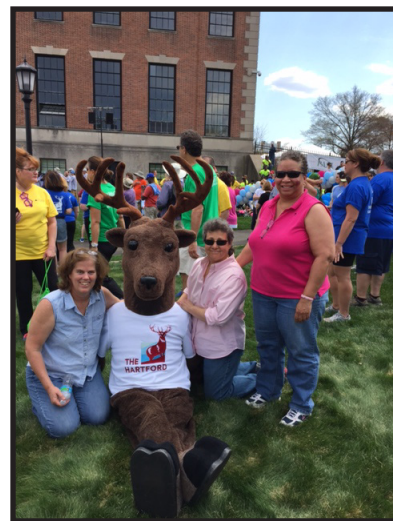
Walk against hunger