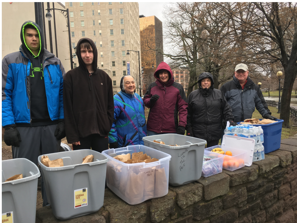
Lunch in the Park