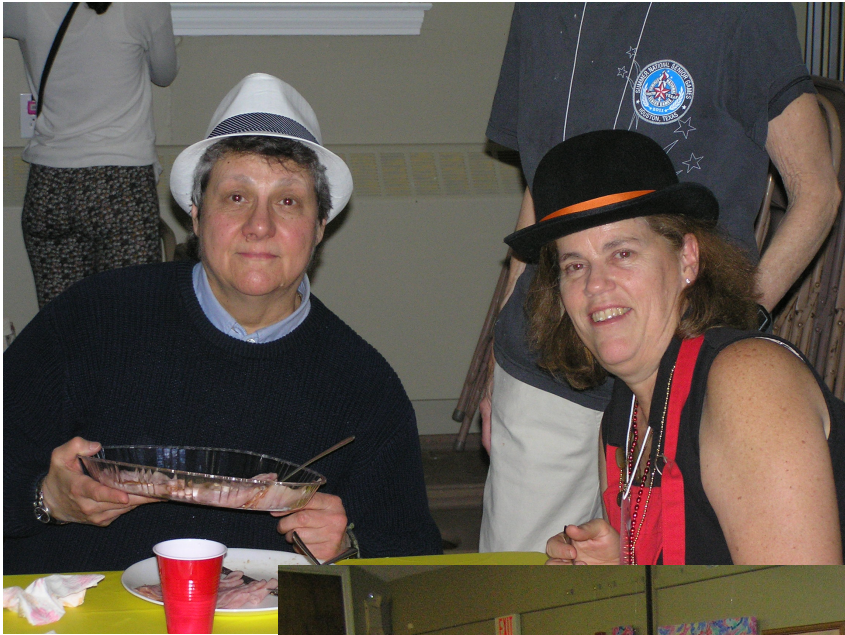
Shrove Tuesday Pancake Dinner