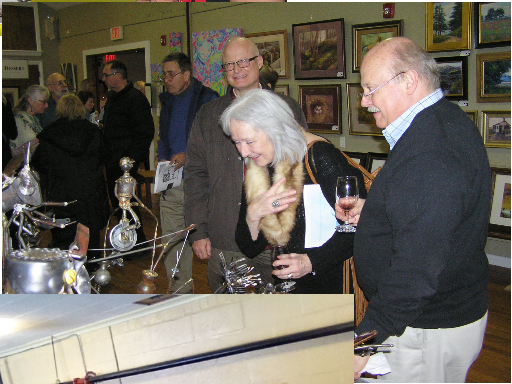
Art in the Abbey