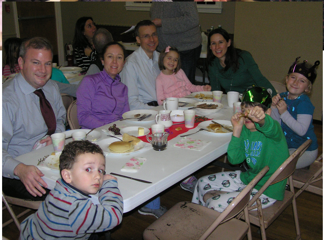
Shrove Tuesday Pancake Supper